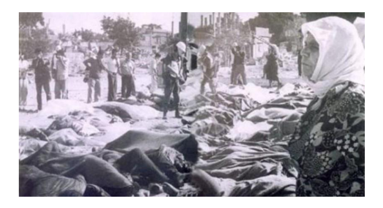
Figure 4: Deir Yassin Massacre 1948

These pictures are from Zionist massacres committed against unarmed civilian Palestinians. The bloody scenes and slaughtering of Palestinians were not a collateral damage, but rather they were organized atrocities which aimed to have a Zionist state in a Palestine that is ethnically cleansed from its indigenous people. They are the result of an orientalist and topographic efforts. Therefore, orientalist discourse is not merely an epistemic violence; it embodies itself as ethnic cleansing. Expulsion of Palestinians came with a detailed "Arabist" description of the methods to be used to forcibly evict Palestinians: intimidation, bombarding villages, setting fire to houses and demolishing them, planting mines in the rubble to prevent the expelled Palestinians from returning (Pappe 2006).