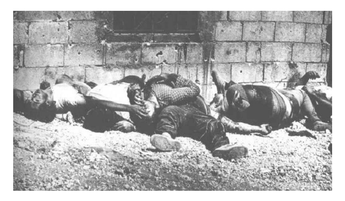
Figure 1: Abu Shusha Massacre 1948