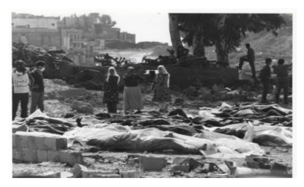
Figure 2: Qibya Massacre 1953